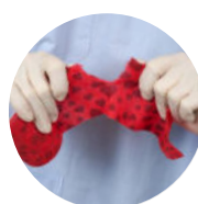
Easy to tear

The fact that the bandage is very light, does not constrict and is not sticky to touch makes it more comfortable for the patient and easy to work with for the nurse, vet, and owner.